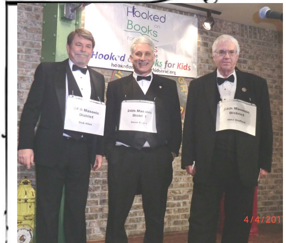
Bee Winners 24th Masonic Lodge

Stay tuned for news about our 12th annual bee in 2018!